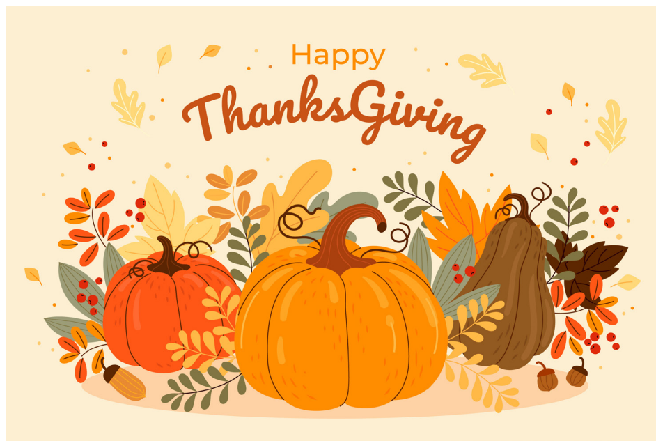
Image by Freepik www.freepik.com/free-vector/flat-thanksgiving-illustration_32201210.htm#query=happy%20Thanksgiving&position=3&from_view=search&track=sph

2:30 pm-5:30 pm November 5 th Magnolia Park https://diabetes.ufl.edu/2022/09/23/uf-diabetes-family-fun-day-education-to-protect-tomorrow/