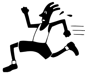
= Energy Out

Below are websites with Calorie Calculators to help you find your personal caloric needs for each day: