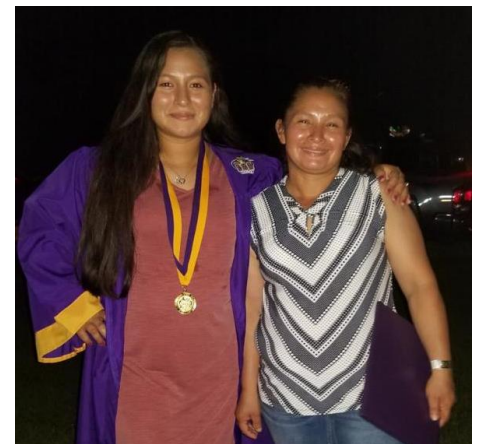
100% of seniors graduated