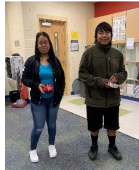
Students that earned community service hours