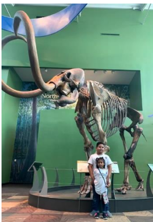
Participants in STEM Triunfadores Camp

The school year 2021-22 started with all the students attending in-person school and the tutorials were set up at schools following the teachers’ directions. During this school year, some school districts implemented the delivery of report cards solely in an online format. The AMCC academic department has been working with parents in explaining the report card and helping them create online accounts that allow parents to see their children's academic progress.