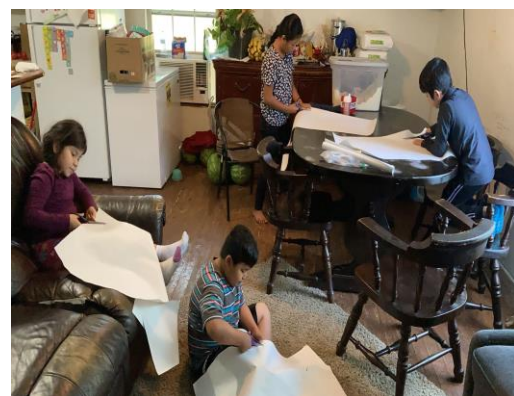
The whole family helps with homework!

The AMCC served 24 high school students with tutorials in core courses, 20 ( 83% ) of these students increased their grades on the subject being tutored, per the report cards by the end of the tutorial period.