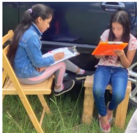
70 students attended our KG to 5th grade summer program.