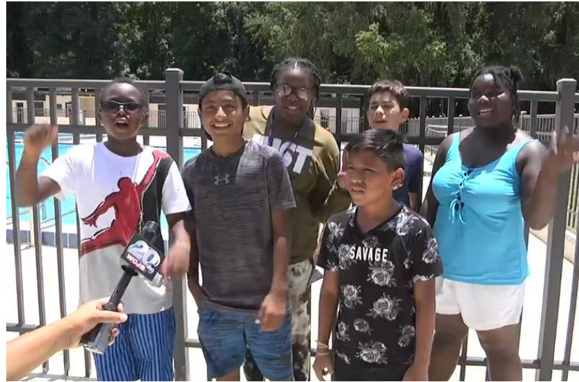
Students at Camp Cuscowilla