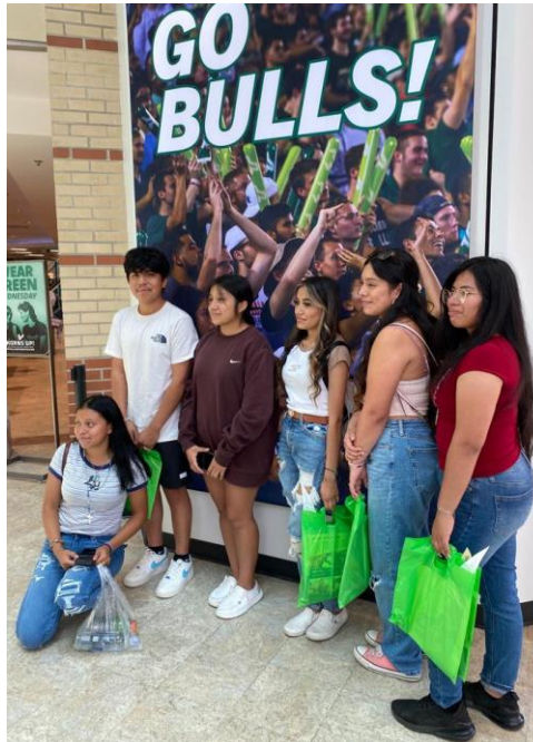
High School students on a tour of the University of South Florida