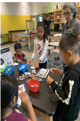
Summer program at the Cade Museum for Creativity and Invention

In an effort to improve learning, and address the learning gap, the academic team worked with parents, guidance counselors and teachers of migrant students to set up tutorial sessions of Priority for Service (PFS) students in academic need. Through the year, the coordinators kept in close contact with parents to keep them informed of attendance issues, lack of homework being turned in by students, and teaching them how to read and understand the report card. For high schoolers, the focus was also on grades, GPA, and graduation requirements. Emphasis was also in engaging parents to be active participants in the academic life of the students. During parent involvement meetings and home visits, this active engagement was explained, and discussed as a key aspect of students’ success. Our MPAC representatives spoke at these meetings bringing home this message that was well received by attendees. This was evident by the questions asked and the desire to learn more.