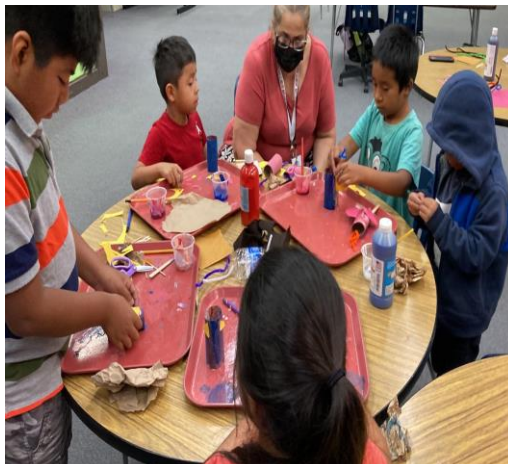
51 students attended our KG to 5th grade summer program.