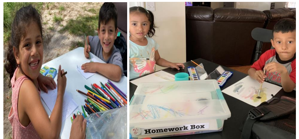
In person tutorials are back in session after COVID