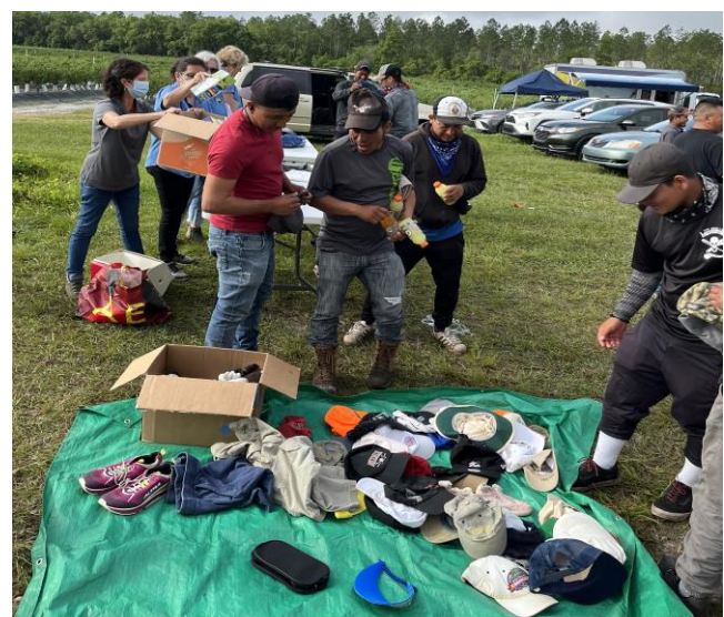
OSYs receiving donations at the Blueberry Fair

2021-22 continued to be a very challenging year to provide services for OSY. The AMCC served this population by providing English lessons guides, health fairs, referrals to clinics and health services. Our program also collaborates with area businesses that donate gently used shoes, jeans, socks, and other much needed items requested by the OSY.