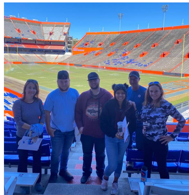
High School students on a tour of the University of Florida

We are proud to say that 11 seniors graduated with a high school diploma, and 1 student received a certificate of completion. This represents 86% of migrant seniors. Moreover, 4 seniors received the biliteracy seal on their diplomas.