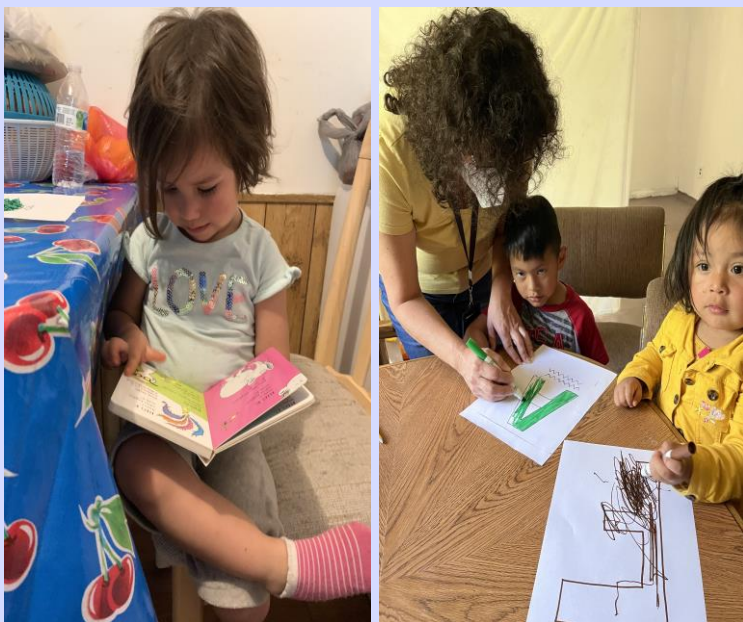
In home tutoring for PK students

116 families (22%) with children in grades K-12th participated in different migrant parent involvement meetings where topics such as attendance, school readiness activities, report card reading, high school graduation requirements, among others were discussed.