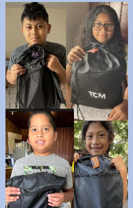
Students that received Backpacks from Title 1

11 students from 5 counties attended a credit accrual/ recovery program with the support of the migrant program. Students were paired with a tutor to support them in many ways. In Columbia County the students were in need of transportation to the school in order to attend the 3 week program. MEP provided daily transport and a tutor. These students successfully completed 5 courses resulting in 2 ½ credits and promotion to their Senior year! Overall: 9 High school students took 23 courses and completed 17. The remaining 6 courses will be completed during the regular term. The 9 – 9th - 12th grades students received 8.5 credits this summer. 2 Middle School students took 4 courses resulting in grade promotion. One particularly successful case resulted a promotion from 8th grade to 11th because of the 3 middle school courses that had not been satisfied until this summer.