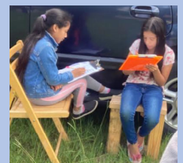
Tutorials during COVID