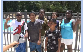
Students at Camp Cuscowilla