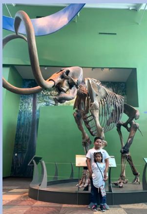
Participants in STEM Triunfadores Camp

https://www.wcib.com/2021/07/13/donations-help-send-400-kids-free-camp-cuscowilla-recreation-center/