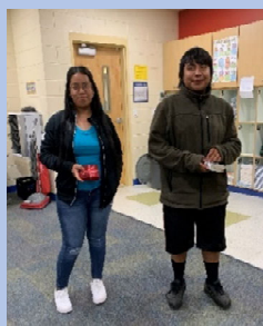
Students that earned Community Service hours