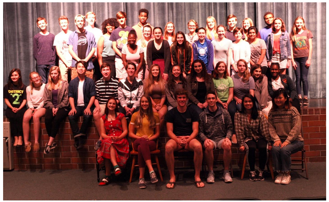
WHOLE GROUP - EHS THESPIAN CLUB