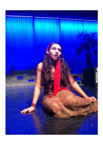
Cast of Jesus Christ Superstar